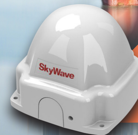
IDP-690 Maritime Terminal 101mm Height 126 Width & Depth